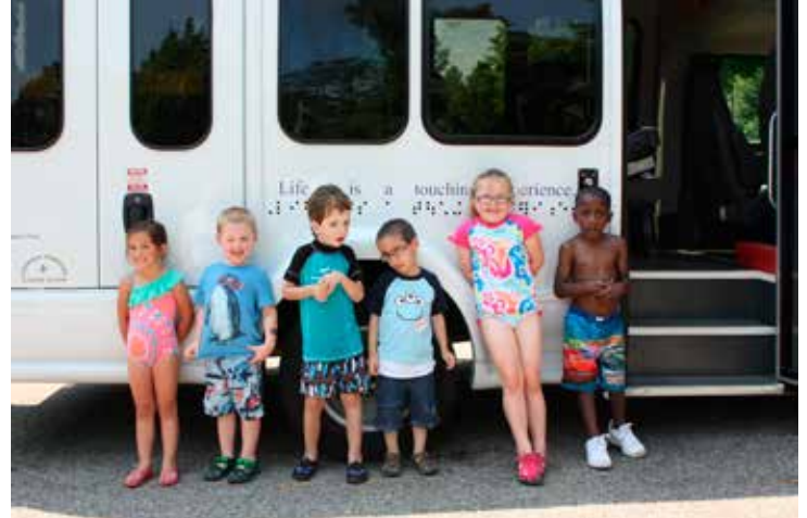
Children lined up at the VIPS van for a field trip to Hogan's Fountain in Cherokee Park.

It was a wonderful time, leaving us itching for more when preschool starts back up in September!