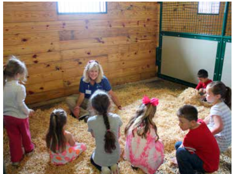
Kids visited a horse's "bedroom."