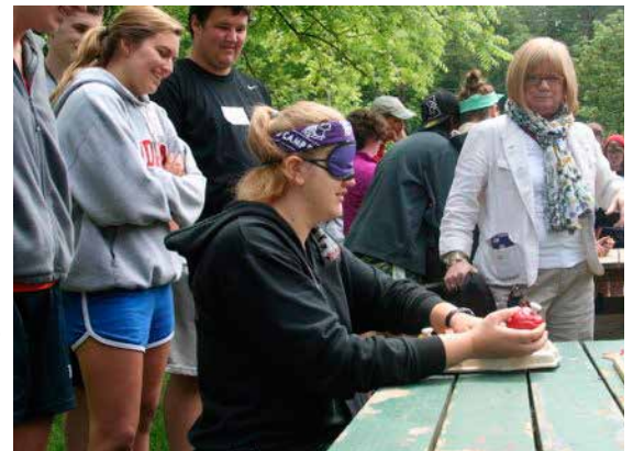
A volunteer tries a task under sleep shades.