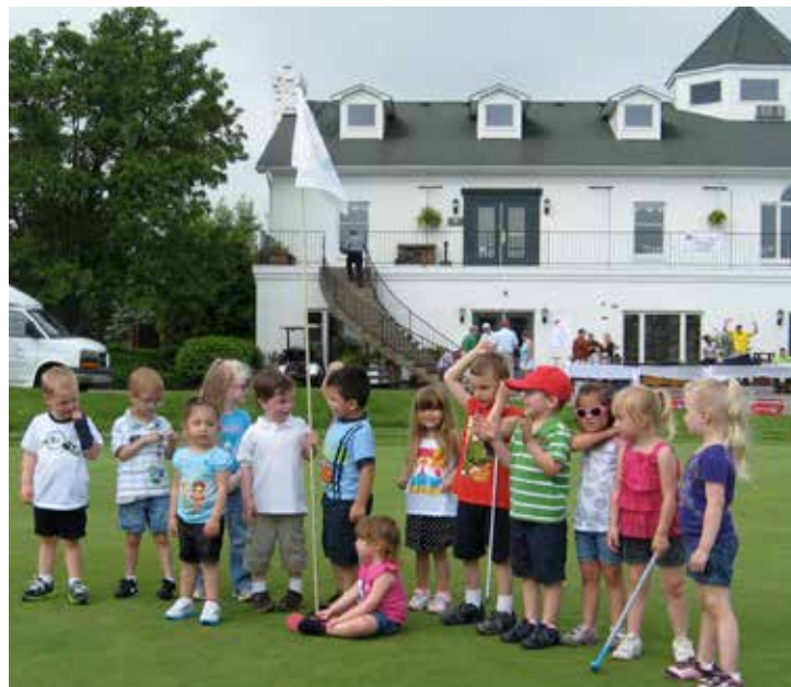
VIPS kids get some greens time at the KFC Yum Golf Tournament at Persimmon Ridge on May 20.