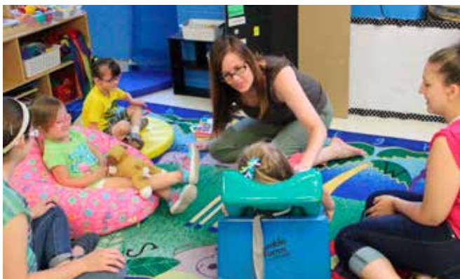
Miss Dixie sings with the children during circle time.

The summer preschool worked out beautifully and we hope to expand upon our program next summer!