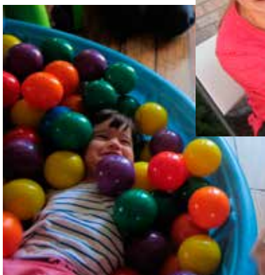
Below: Lola relaxes in the ball pool.