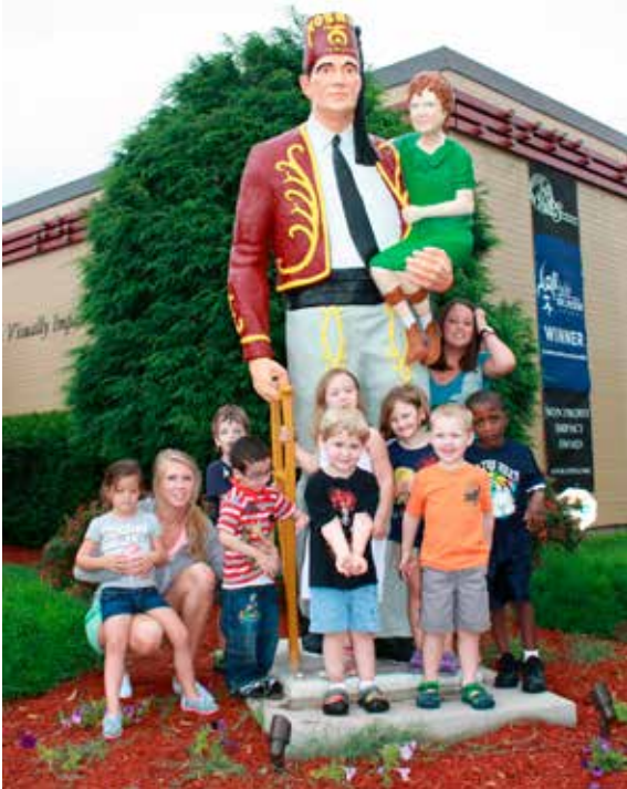
VIPS KidsTown preschoolers pose in front of the Kosair Shriners statue at VIPS.

Younger Woman's Club of Louisville provided $680 for the Two Day 2's Class.