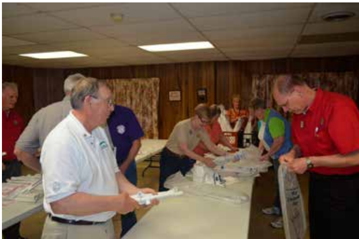
Riley Township Lions bag play frame kits.

Infants and toddlers who are blind can be timid about exploring the world around them and touching new textures. Teachers of the Visually Impaired who work with infants and toddlers often use PVC pipe to make play frames to hang toys and household items that encourage exploration of different textures, sounds and smells. This exploration fosters both physical and cognitive development. As a child gets older and learns to stand, the PVC can be adjusted into a pre-cane device. However it is difficult for busy teachers to find time to create these structures.