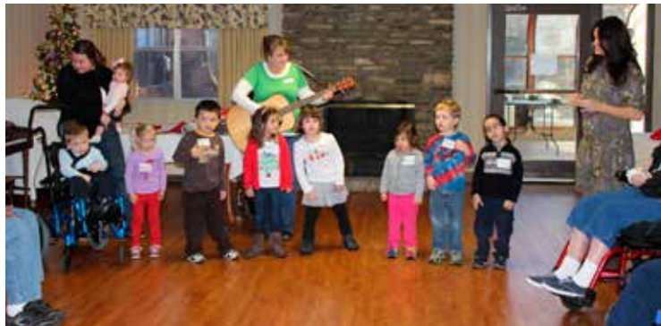
The children sang their Christmas Carols loud and proud at the Golden Living Center to the delight of the residents.