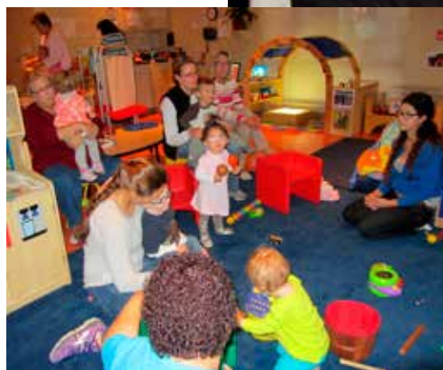
Left: The classroom is hardly big enough to contain the excitement that children and parents bring to PAL.