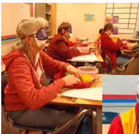
Lions experiment with accomplishing tasks by touch.

a brief history and progress report, suggested ideas about sponsoring VIPS families, holding fundraisers, and becoming an Indiana