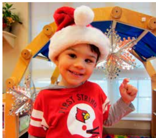
Cannon likes wearing the Santa hat.

The winter holiday season offers many opportunities to include fun textures, smells, and shiny objects into the classroom. The children were excited to make ornaments and then to use the