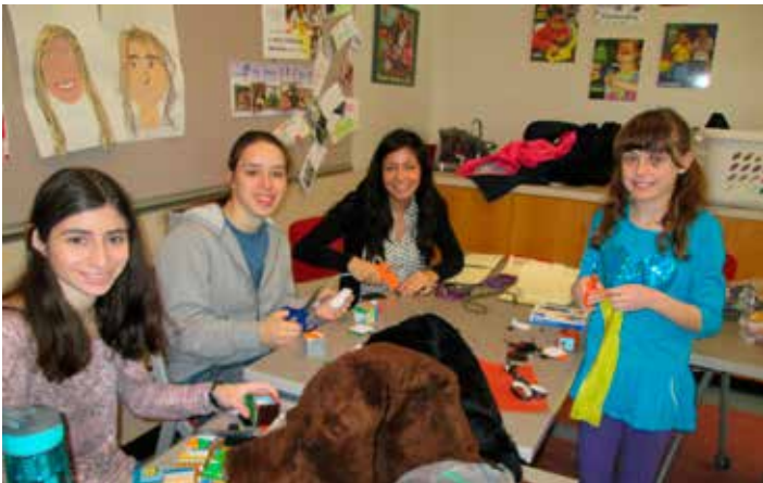
Crafting for VIPS Bloomington