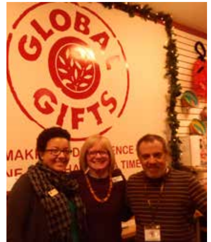
Our friends from Global Gifts donated 10% of sales on Nov. 18.