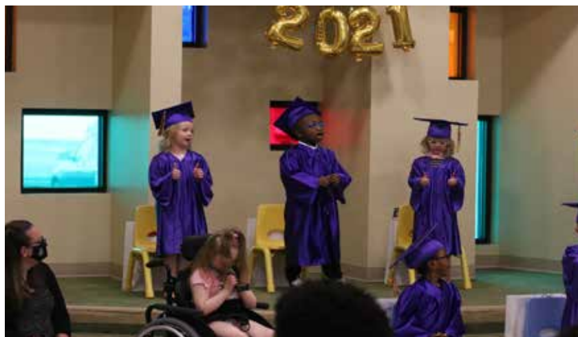
Photo above: Graduates, in their purple caps and gowns, sing and perform a song.

Congratulations, VIPS Kids Town Preschool Class of '21! We're so happy for you and we certainly hope you know it!