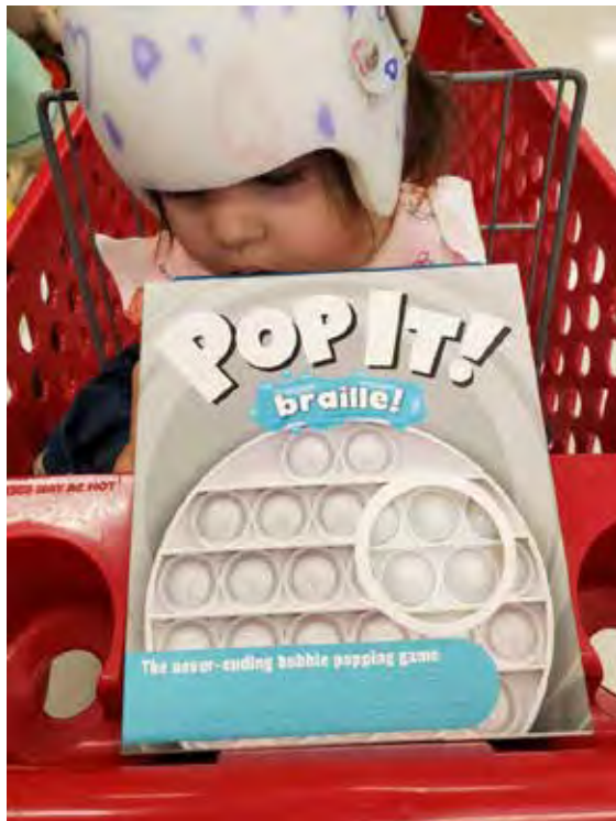
Photo: Felicity sits in the seat of the grocery cart holding the PopIt! toy. She is wearing a helmet, and her dark curls are showing from the sides.

https://www.target.com/p/chuckle-38-roar-pop-it-braille-fidget-and-sensory-toy/