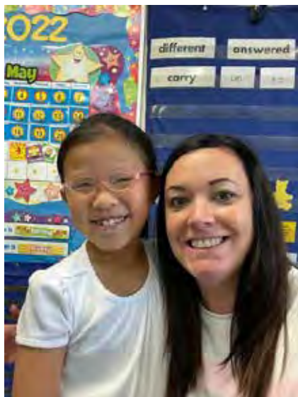
Photo: A little girl, smiling broadly and wearing pink glasses, gets a hug from her TVI, also smiling. They look like great friends! There are classroom boards in the background.