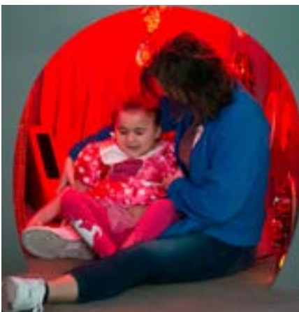
Photo Captions: VIPS Indy events below -- on the left, a mother sits with her little girl, dressed in Mini Mouse costume, in a glowing red tunnel in the Sensory Room. On right, parents and children surround tables filled with toys for the taking.

We were so excited to host the Toys for Tots Toy Giveaway in Indianapolis this past holiday season! It was so heartwarming watching VIPS children and their siblings pick out a toy and play together in Toddler Town. Thank you to the families who came and to our VIPS team for putting this event together!